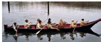
Bill White image

Corps of Discovery paddled their dugouts on this route going downstream.)