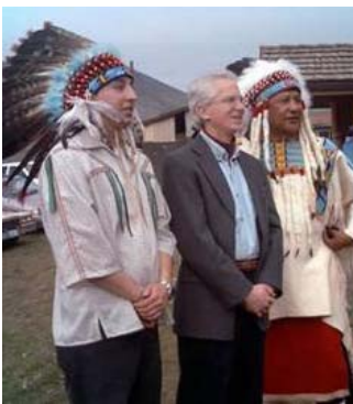
Tribal leaders and the BPA administrator at Celilo commemorations in March