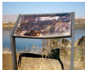
Rock Fort

ing a comprehensive data sheet and providing images, text, and observations about site conditions. Oregon has over 100 such assets.