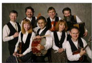
The Trail Band