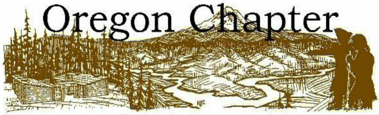
Lewis and Clark Trail Heritage Foundation