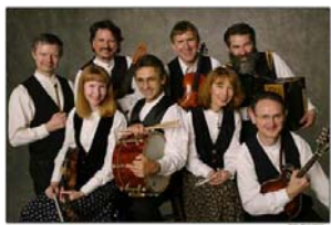
The Trail Band